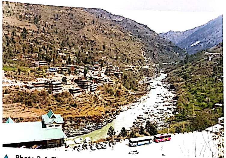
▲ Photo 3.4: The many ecosystem benefits of the Hindu Kush Himalayan region for the water–food–energy nexus: the Rampur dam in India

South Asia faces the challenge of providing enough water and energy to grow enough food for the increasing population. The Hindu Kush Himalayan (HKH) ecosystem is vital for the promotion of food, water and energy security downstream. The issues and challenges in the food, water and energy sectors are interrelated in many ways and cannot be managed effectively without integration. Moreover, there is a high degree of dependency of downstream communities on upstream ecosystem services such as water for irrigation, HEP and drinking water.